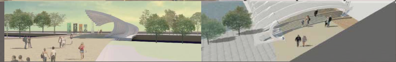
WTA Zhuhai Tennis Center Southgate