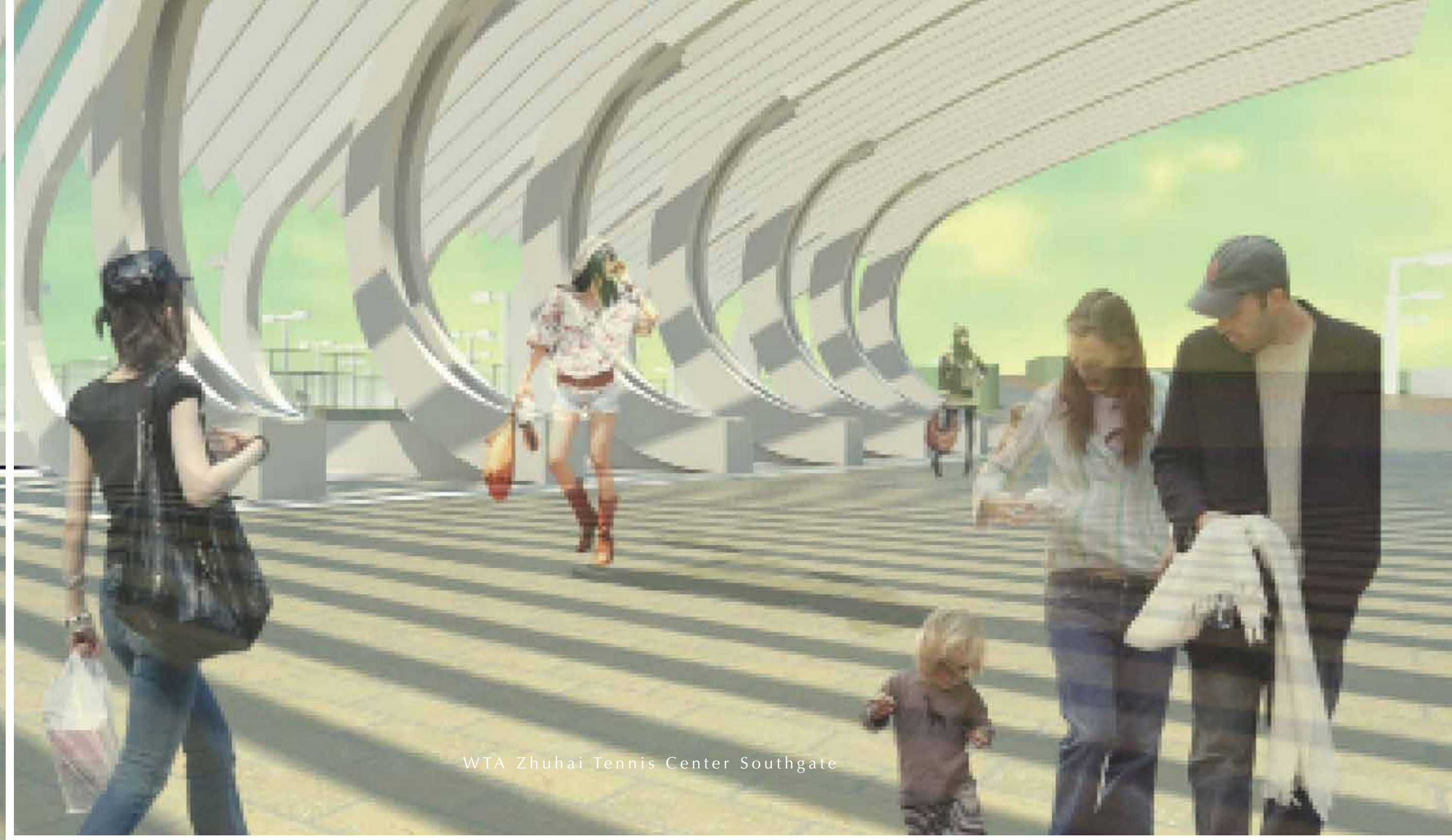
WTA Zhuhai Tennis Center Southgate